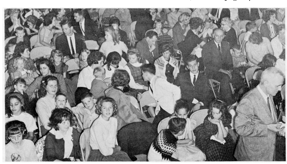
Part of the crowd--sitting pretty!

The pot-luck dinner was marked with a new and very effective method of serving because of the over-sized (cont. on page 4)