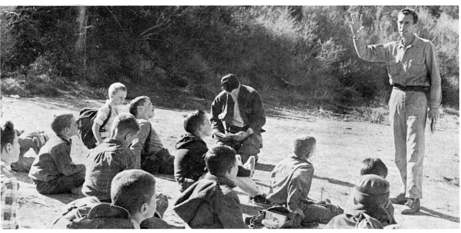
Five miles to go!!!

Though this event is not receiving the acclaim of the people of the world — WE as the people of God should be praying for the success and the final conclusion that all things be done according to His will.